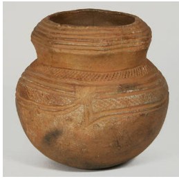
Title: Pot Date: not dated Primary Maker: Zande people Medium: pottery