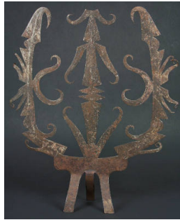
Title: Shrine Iron Date: not dated Primary Maker: Fon people Medium: iron