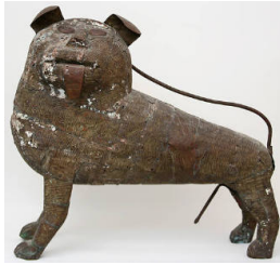
Title: Guardian Lion Date: not dated Primary Maker: Fon people Medium: wood and copper alloy