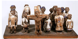
Title: Mission Board Date: 20th century Primary Maker: Fon people Medium: wood, pigment and iron