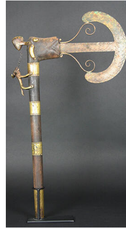
Title: Fon Scepter Date: 20th Century Primary Maker: Fon people Medium: Wood and copper