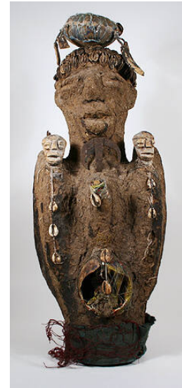
Title: Protective Figure (Bocio) Date: 20th century Primary Maker: Fon people Medium: wood, gourd, cotton, iron, fruit pits, cowrie shells and encrustation