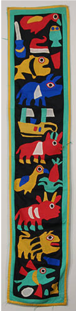
Title: King's List Cloth Date: 20th century Primary Maker: Fon people Medium: cotton and dye