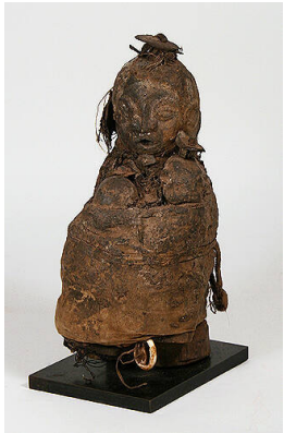
Title: Protective Figure (Bocio) Date: 20th century Primary Maker: Fon people Medium: wood, cotton, iron, cowrie shells, plant fiber, accumulative material and encrustation