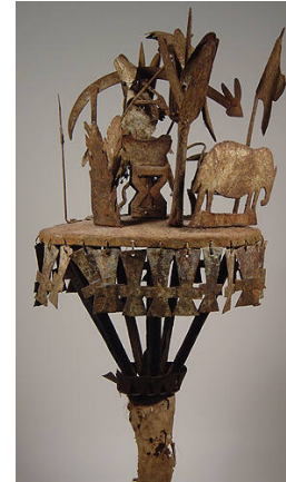
Title: Altar (Asen)