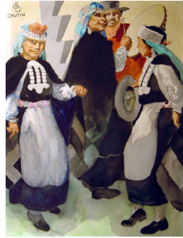
Title: Cautin Date: ca. 1945 Primary Maker: Carl Folke Sahlin Medium: watercolor and pencil on paper