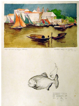
Title: Colored Sails in Belem/The Meanest Fish in the World - The Piranhas of the Amazon Date: 1941 Primary Maker: Carl Folke Sahlin Medium: ink and watercolor on paper