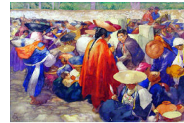
Title: Otavala Indians, Ibarra, Ecuador Date: ca. 1945 Primary Maker: Carl Folke Sahlin Medium: watercolor on paper