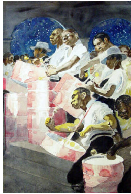
Title: Steel Band, Trinidad Date: ca. 1941 Primary Maker: Carl Folke Sahlin Medium: watercolor on paper