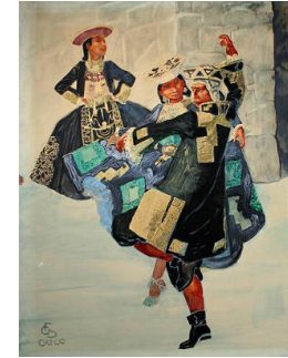
Title: Danza de Panuelo, Cuzco, Peru Date: ca. 1945 Primary Maker: Carl Folke Sahlin Medium: watercolor, ink and pencil on paper