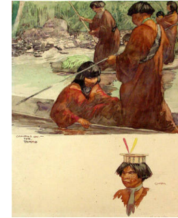
Title: Campas on the Tambo Date: 1945 Primary Maker: Carl Folke Sahlin Medium: watercolor on paper