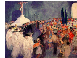
Title: Cuzco Date: ca. 1945 Primary Maker: Carl Folke Sahlin Medium: watercolor on paper