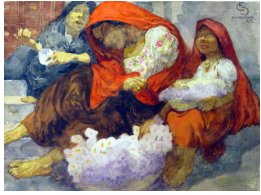
Title: Church Steps of Quito, Ecuador Date: 1945 Primary Maker: Carl Folke Sahlin Medium: watercolor on paper