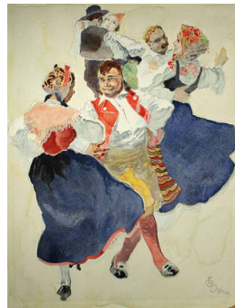
Title: Dancers Date: not dated Primary Maker: Carl Folke Sahlin Medium: watercolor on paper