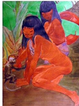
Title: Colombia Date: ca. 1945 Primary Maker: Carl Folke Sahlin Medium: watercolor on paper