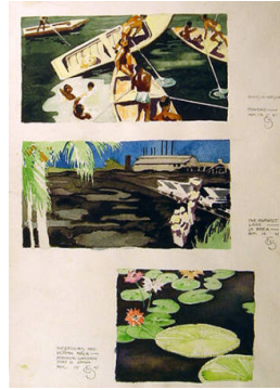
Title: Divers in Antigua, Trinidad/The Asphalt Lake - La Brea /Waterlilies and Victoria Regia Botanical Garden, Port of Spain Date: 1941 Primary Maker: Carl Folke Sahlin Medium: watercolor and pencil on paper