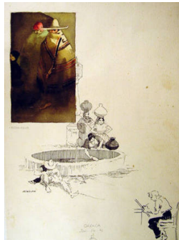
Title: Oaxaca Date: 1941 Primary Maker: Carl Folke Sahlin Medium: watercolor, ink and pencil on paper