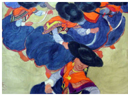
Title: Dancers, Cuzco Date: ca. 1945 Primary Maker: Carl Folke Sahlin Medium: watercolor on paper