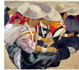
Title: Sombreros, Otavalo Date: 1945 Primary Maker: Carl Folke Sahlin Medium: watercolor on paper