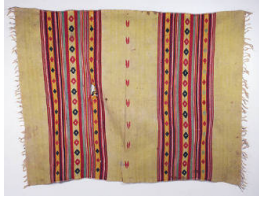
Title: Utility Cloth (Tzute) Date: collected 1932 Primary Maker: Artist Unknown Medium: cotton and dye