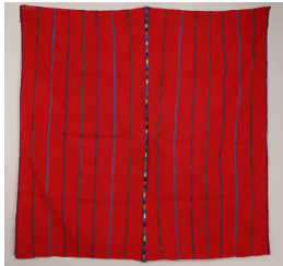
Title: Utility Cloth (Tzute) Date: ca. 1975 Primary Maker: Artist Unknown Medium: cotton, silk and dye