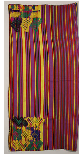
Title: Utility Cloth (Tzute) Date: ca. 1960 Primary Maker: Artist Unknown Medium: cotton, silk and dye