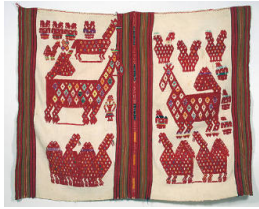
Title: Utility Cloth (Tzute) Date: early 20th century Primary Maker: Artist Unknown Medium: cotton, silk and dye