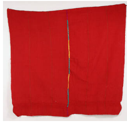
Title: Utility Cloth (Tzute) Date: collected 1932 Primary Maker: Artist Unknown Medium: cotton, silk and dye