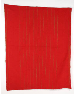
Title: Utility Cloth (Tzute) Date: collected 1932 Primary Maker: Artist Unknown Medium: cotton and dye