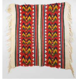
Title: Utility Cloth (Tzute) Date: 1910-1920 Primary Maker: Artist Unknown Medium: cotton and dye