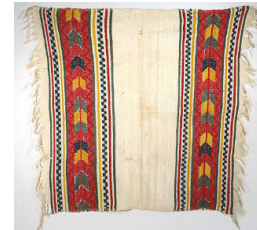
Title: Utility Cloth (Tzute) Date: collected 1932 Primary Maker: Artist Unknown Medium: cotton and dye