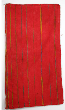
Title: Utility Cloth (Tzute) Date: collected 1932 Primary Maker: Artist Unknown Medium: cotton and dye