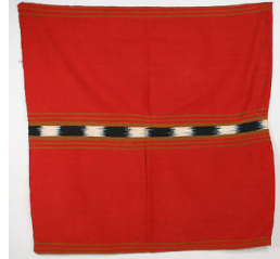
Title: Utility Cloth (Tzute) Date: collected 1932 Primary Maker: Artist Unknown Medium: cotton and dye