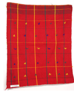
Title: Utility Cloth (Tzute) Date: ca. 1920 Primary Maker: Artist Unknown Medium: cotton and dye