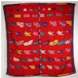
Title: Utility Cloth (Tzute) Date: not dated Primary Maker: Artist Unknown Medium: cotton, rayon, silk and dye