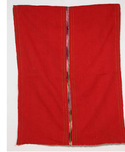
Title: Utility Cloth (Tzute) Date: collected 1932 Primary Maker: Artist Unknown Medium: cotton and dye