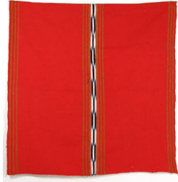
Title: Utility Cloth (Tzute) Date: collected 1932 Primary Maker: Artist Unknown Medium: cotton and dye