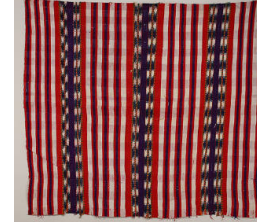
Title: Utility Cloth (Tzute) Date: ca. 1970 Primary Maker: Artist Unknown Medium: cotton and dye