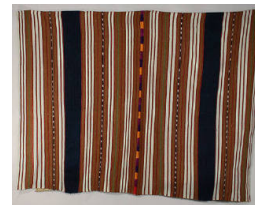
Title: Utility Cloth (Tzute) Date: not dated Primary Maker: Artist Unknown Medium: cotton, silk and dye