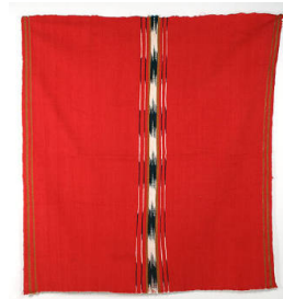
Title: Utility Cloth (Tzute) Date: collected 1932 Primary Maker: Artist Unknown Medium: cotton and dye