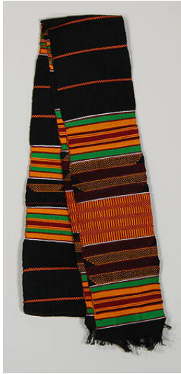
Title: Kente Cloth Strip Date: collected between 1960-1973 Primary Maker: Akan people Medium: silk and dye