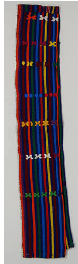
Title: Kente Cloth Strip Date: collected between 1960-1973 Primary Maker: Akan people Medium: cotton and dye