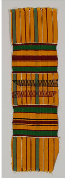
Title: Kente Cloth Strip Date: collected between 1960-1973 Primary Maker: Akan people Medium: cotton and dye