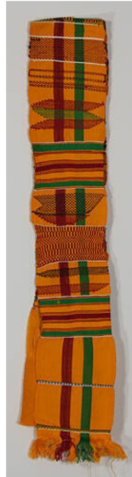
Title: Kente Cloth Strip Date: collected between 1960-1973 Primary Maker: Akan people Medium: cotton and dye