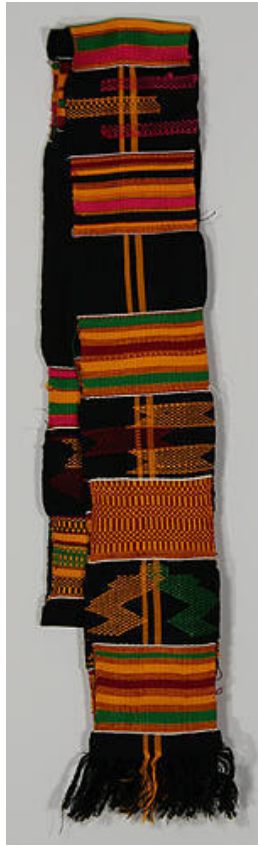
Title: Kente Cloth Strip Date: collected between 1960-1973 Primary Maker: Akan people Medium: silk and dye