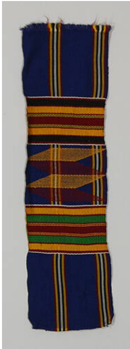
Title: Kente Cloth Strip Date: collected between 1960-1973 Primary Maker: Akan people Medium: cotton and dye