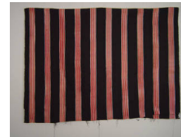
Title: Cloth Date: not dated Primary Maker: Baulé people Medium: cotton and dye