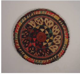
Title: Mat (Gombe) Date: collected between 1960-1973 Primary Maker: Hausa people Medium: plant fiber and dye