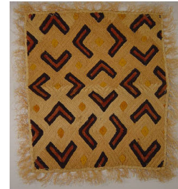
Title: Mat Date: ca. 1970 Primary Maker: Kuba people Medium: raffia and dye