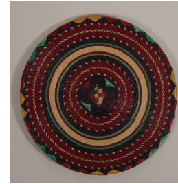
Title: Mat (Gombe) Date: collected between 1960-1973 Primary Maker: Hausa people Medium: plant fiber and dye