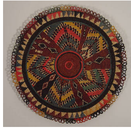
Title: Mat (Gombe) Date: collected between 1960-1973 Primary Maker: Hausa people Medium: plant fiber and dye