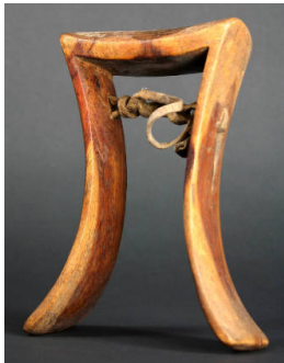
Title: Headrest Date: not dated Primary Maker: Karamojong people Medium: wood and leather