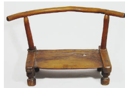
Title: Chair (Gba) Date: ca. 1925 Primary Maker: N'Gere people Medium: wood, copper alloy and cowrie shell