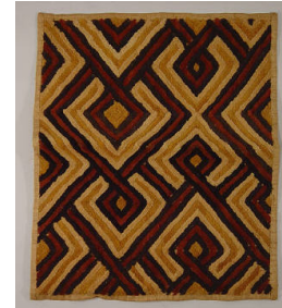
Title: Mat Date: ca. 1970 Primary Maker: Kuba people Medium: raffia and dye