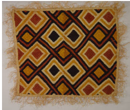
Title: Mat Date: ca. 1970 Primary Maker: Kuba people Medium: raffia and dye