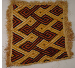
Title: Mat Date: ca. 1970 Primary Maker: Kuba people Medium: raffia and dye