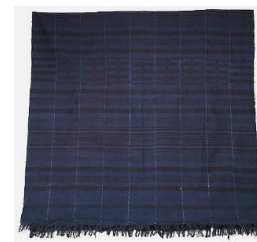
Title: Blanket Date: 20th century Primary Maker: Dogon people Medium: cotton and indigo dye