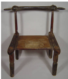
Title: Chair Date: 20th century Primary Maker: Guro people Medium: wood, copper alloy and pigment