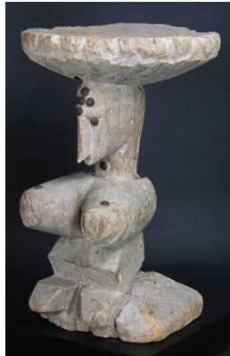
Title: Stool Date: not dated Primary Maker: Bamana people Medium: wood and brass tacks