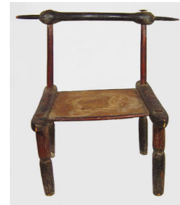
Title: Chair Date: 20th century Primary Maker: Guro people Medium: wood, copper alloy and pigment