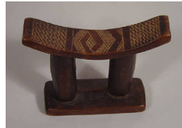
Title: Headrest Date: mid 20th century Primary Maker: Kuba people Medium: wood