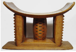
Title: Stool (Mmam) Date: ca. 1960 Primary Maker: Asante people Medium: cece wood