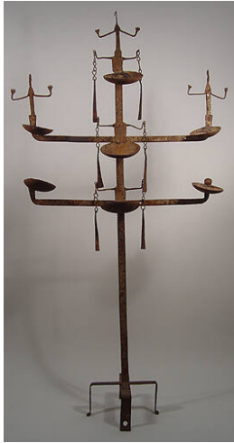
Title: Lamp Date: 20th century Primary Maker: Dogon people Medium: iron