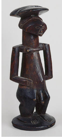
Title: Stool Figure Date: early 20th century Primary Maker: Luba people Medium: wood and pigment