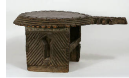
Title: Stool Date: not dated Primary Maker: Bozo people Medium: wood, stain and copper alloy