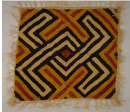
Title: Mat Date: ca. 1970 Primary Maker: Kuba people Medium: raffia and dye