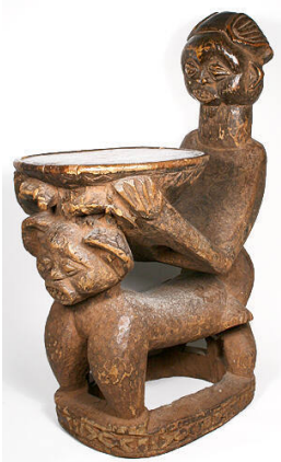
Title: Stool Date: not dated Primary Maker: Bamileke people Medium: wood and stain