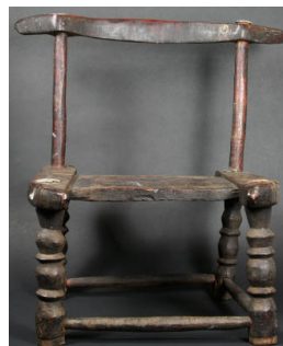
Title: Chair Date: not dated Primary Maker: Artist Unknown Medium: wood, stain and white metal