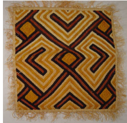
Title: Mat Date: ca. 1970 Primary Maker: Kuba people Medium: raffia and dye