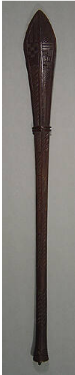
Title: Club Date: 19th century Primary Maker: Artist Unknown Medium: wood and stain