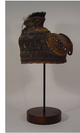
Title: Basketry Mask (Baba) Date: ca. 1945 Primary Maker: Abelam people Medium: reed, feathers, plant fiber, pigment and encrustation