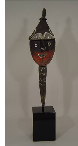
Title: Ceremonial Head (Yina) Date: ca. 1965 Primary Maker: Nukuma people Medium: wood and pigment