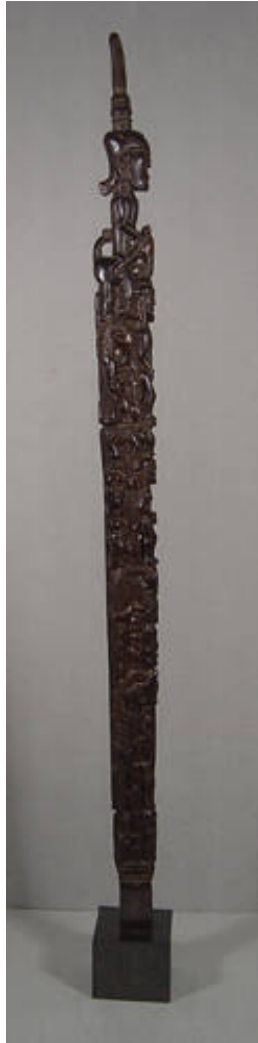
Title: Staff (Tunggal Punaluan)