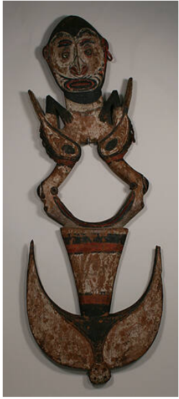
Title: Suspension Hook (Tsambun)

Date: probably 1st half of the 20th century