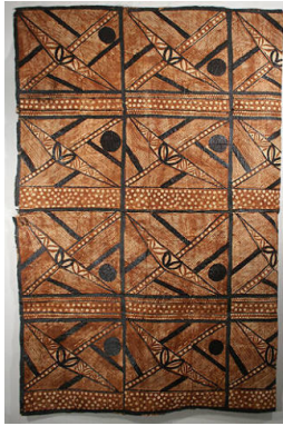
Title: Tapa Cloth Date: 20th century Primary Maker: Artist Unknown Medium: bark cloth and paint