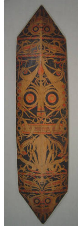
Title: Shield (Klebit Bok) Date: late 19th to early 20th century Primary Maker: Kayan Dayak people Medium: wood and paint