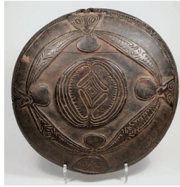
Title: Bowl Date: early 20th century Primary Maker: Artist Unknown Medium: sago wood