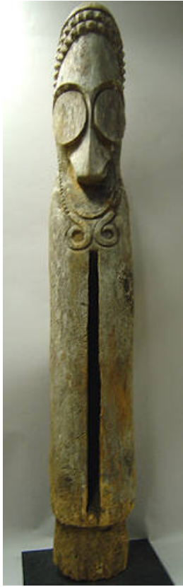
Title: Slit Drum Date: early to mid 20th century Primary Maker: Artist Unknown Medium: wood