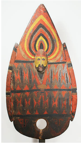
Title: Dance Paddle Date: late 19th to early 20th century Primary Maker: Wosera people Medium: wood and paint