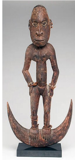
Title: Skull Hook Date: late 19th to early 20th century Primary Maker: Artist Unknown Medium: wood, stain, shell beads and plant fiber